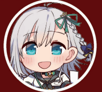
Onsen Musume Matsushima Nazuki

(ホテル海風土・ホテル絶景の館・松島センチュリーホテル・松島一の坊・ホテル壮観・小松館好風亭・ホテル大松荘)